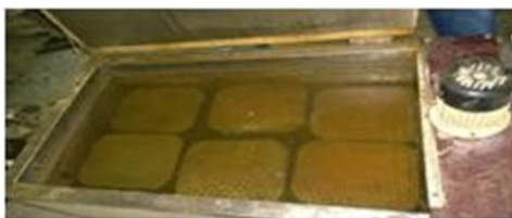
Figure 6: Accelerated Curing of Cubes in Boiler at 60°C

Curing was done by covering the blocks with a damp cloth for period of 3 days, then the moulds were taken to KJ Somaiya Polytechnic College, Vidyavihar, Mumbai for Accelerated Curing.