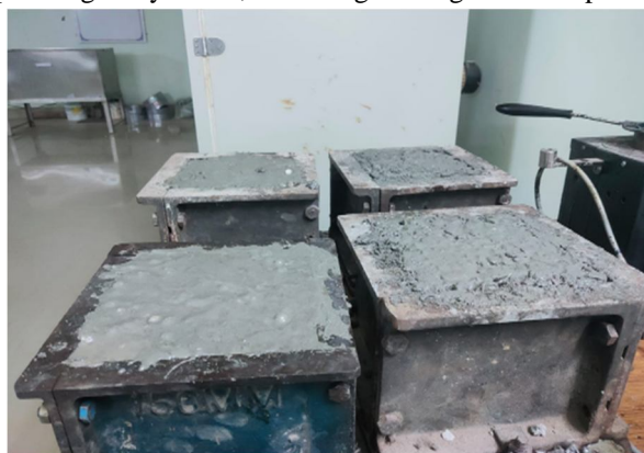
Figure 1: EPS Concrete

Lightweight concretes (LWCs) can be used in various construction fields. It can be used for repairing wooden floors of old buildings, carrying walls of low thermal conduction, bridge decks, floating quay, etc. For the first applications, the lightest possible material is used, i.e., usually it has a specific gravity of 0.5, the strength being of less importance.